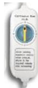
Time Regulator 2-4-6-8 ml/hr